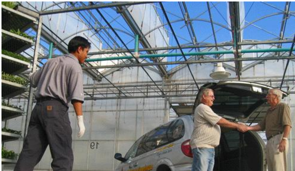
Scheduled appointments mean less waiting for you

Our shipping docks can accommodate even the largest trucks to quickly load larger orders and have your truck off and rolling with quality liners.