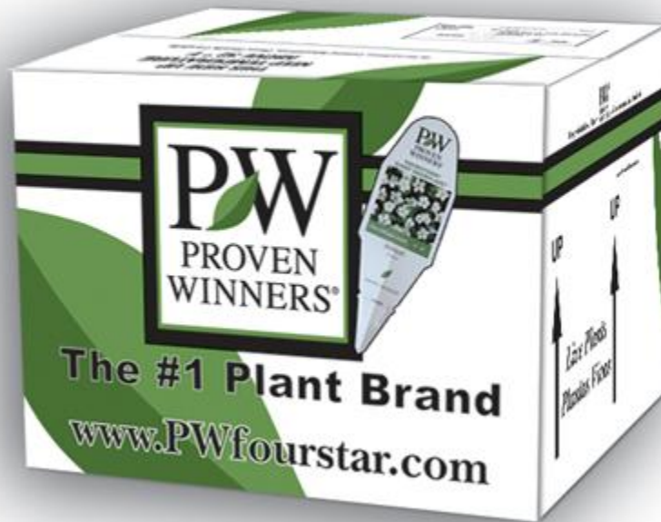
The Big Box Rocks, But Doesn't Roll

By shipping our product in a larger, square 8 count box we have greatly reduced the potential of it getting turned on it's side during transit to you. Another great benefit is that we will now ship twice the number of trays per box at near the same cost as the smaller box. This equals great savings to you - calculate your cost per tray and compare! ( see rates )